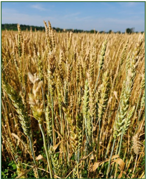
Small grain acres were up 2.3% over last year, totaling 7.2% row crop acres

The Crawford SWCD completed their annual cropland tillage survey for Crawford County. For this survey, a predetermined route is driven throughout the county. At known points along this route, crop and tillage information is recorded. Data collected at each point is compiled and compared to previous years to determine trends in crop, tillage and planting methods. This survey has been completed using the same points/fields since 1987, with the exception of slight changes due to the construction of US 30. Soybeans were the most planted crop this spring at 51.7% (+2.1% over 2024) of the row crop acres, followed by corn at 36.7% (+0.7%) and small grains at 7.1% (+2.3%). The latest figures show that 43.3% of corn and soybeans planted this spring were in conservation tillage – either no-till or tillage that left >30% residue after planting. The survey revealed 63.0% (-17.0%) of soybeans planted with >30% residue while 15.7% (-4.6%) of corn acres were planted in >30% residue. Soybeans topped the no-till category with 24.5% (-21.1%) of soybeans no tilled. No-till corn acres were at 4.4% (-6.6%).