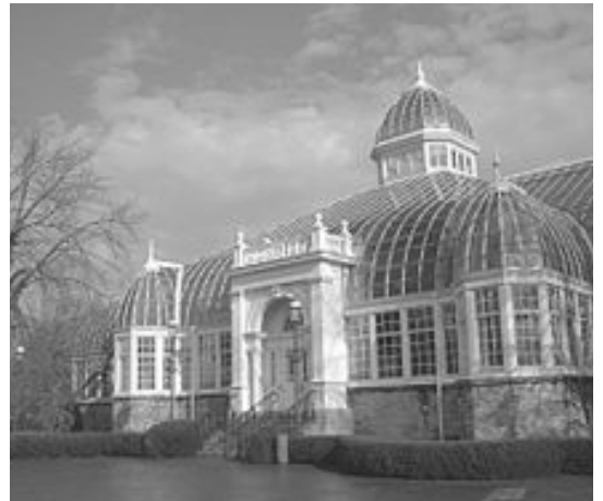
FRANKLIN PARK CONSERVANCY