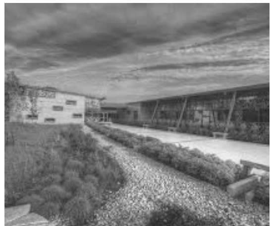
GRANGE INSURANCE AUDUBON CENTER